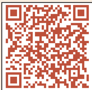
ESV WEBSITE INTRODUCTION